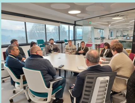
Picture 1. Spanish Workshop